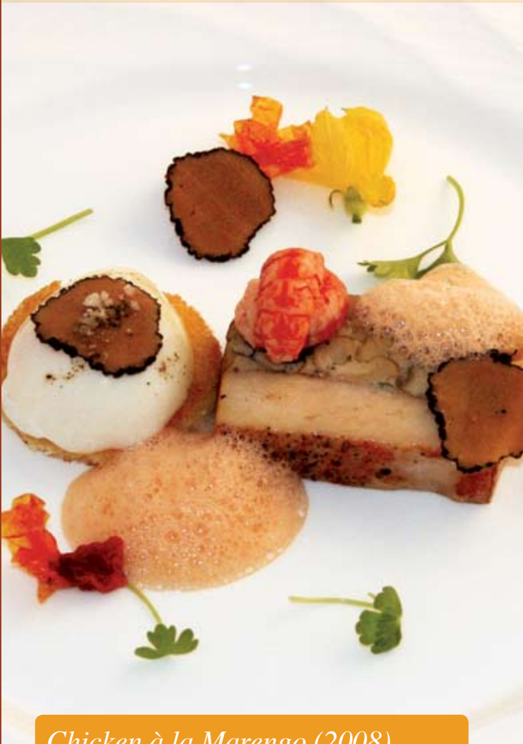
Chicken à la Marengo (2008)

This interpretation deconstructs the recipe's ingredients into modern components on a plate.