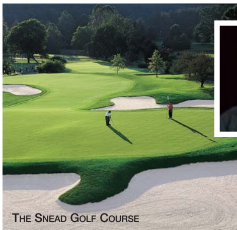
THE SNEAD GOLF COURSE