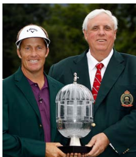
STUART APPLEBY, THE INAUGURAL WINNER OF THE GREENBRIER CLASSIC, IS PICTURED WITH JIM JUSTICE, HOLDING THE TOURNAMENT TROPHY. HE SHOT A HISTORIC 59 IN THE FINAL ROUND.

“Golf is always a delightful experience and I know The Greenbrier will be quite an experience.” — CHARLES BARKLEY